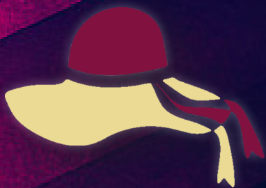
red hat pineapple & bitters