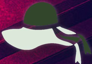
green hat gin & olive